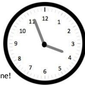
The clock - a circular number line!